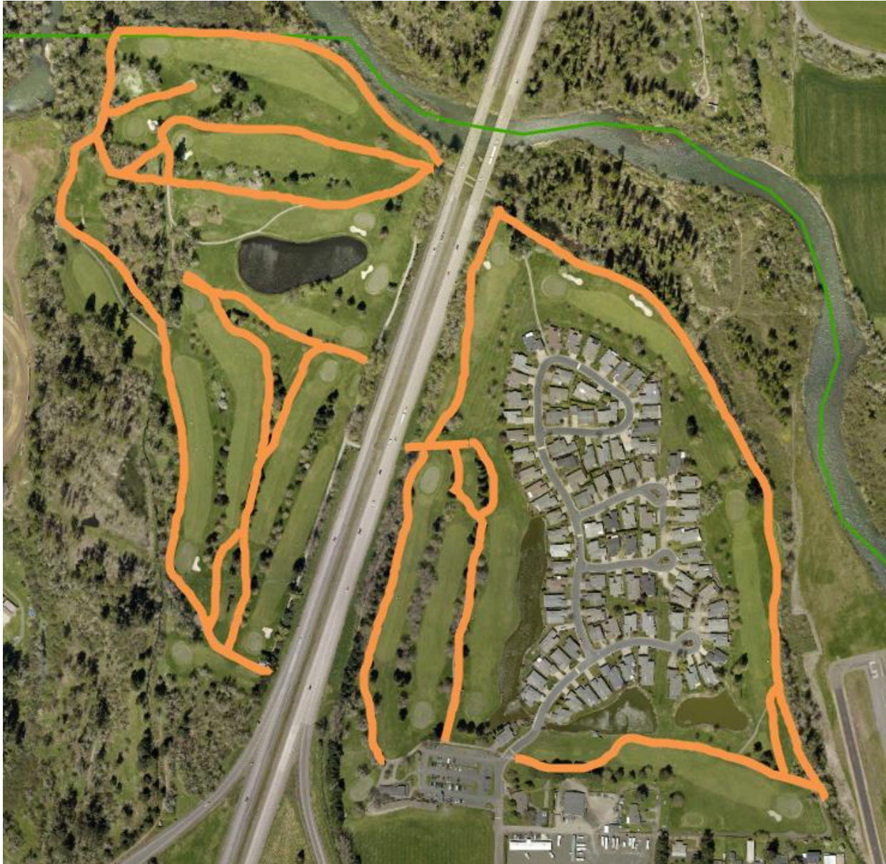
Middlefield Golf Course Cart Paths. Approximately 20,500 Lineal Feet ranging from 5 feet in width to 8 feet. Approximately 160,000 total Square Feet. Middlefield Golf Course is located at 91 Village Drive in Cottage Grove.